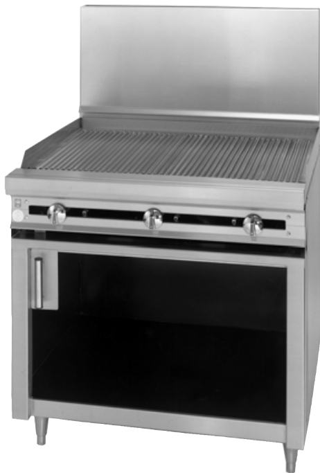
JTRH-36GG with stainless steel riser